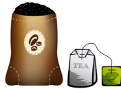
Coffee Grounds, Filters & Tea bags