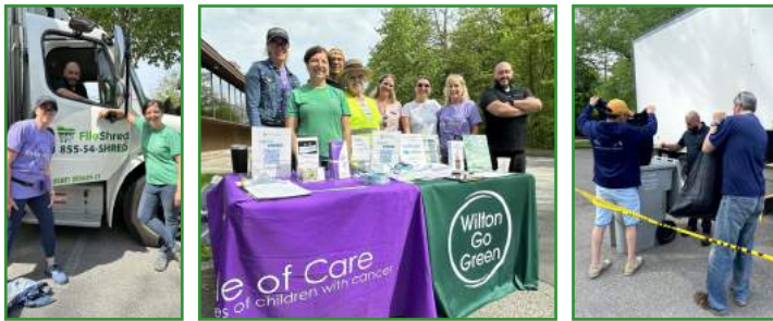
Circle of Care is a non-profit organization dedicated to supporting childhood cancer patients and their families for their entire experience, from day of diagnosis to wherever the journey leads.